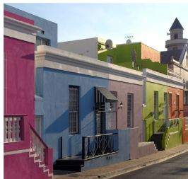
Table Mountain, Cape Point, Wine Route?... What's first on your list?

There's so much to do and you don't know where to start. Let us take the hassle out of your holiday and show you the sights and sounds of the Mother City, all while you're enjoying a little of our famous VIP treatment.